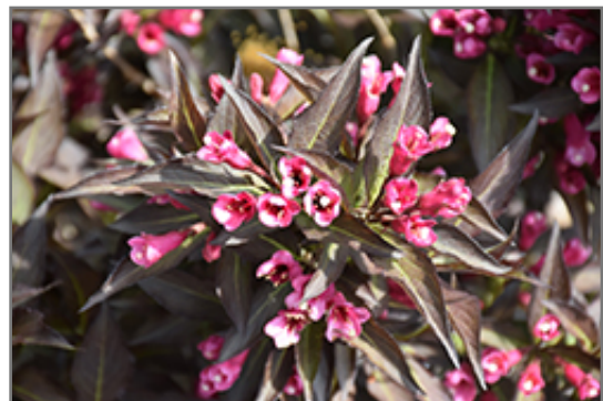
Midnight Wine Weigela flowers