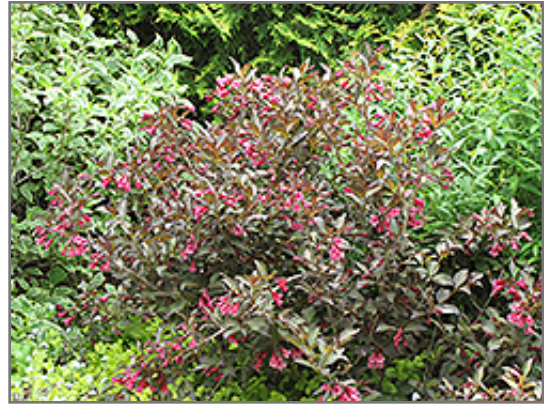
Midnight Wine Weigela in bloom