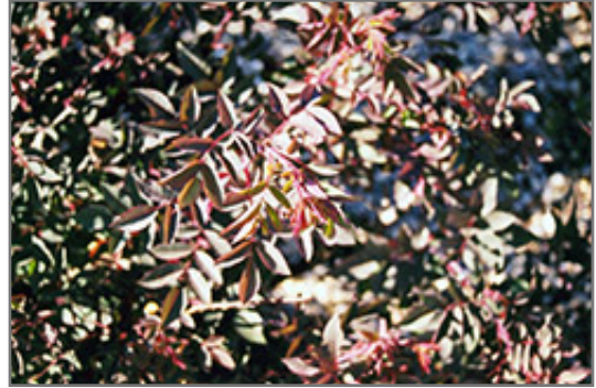
Red Leaf Rose foliage

This shrub should only be grown in full sunlight. It does best in average to evenly moist conditions, but will not tolerate standing water. It is not particular as to soil type or pH. It is highly tolerant of urban pollution and will even thrive in inner city environments. This species is not originally from North America.