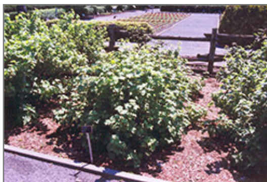
Red Lake Red Currant