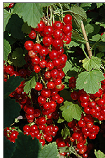
Red Lake Red Currant fruit

This is a dense multi-stemmed deciduous shrub with an upright spreading habit of growth. Its relatively fine texture sets it apart from other landscape plants with less refined foliage. This plant will require occasional maintenance and upkeep, and is best pruned in late winter once the threat of extreme cold has passed. It is a good choice for attracting birds to your yard. Gardeners should be aware of the following characteristic(s) that may warrant special consideration;