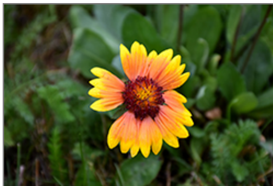
Blanket Flower flowers