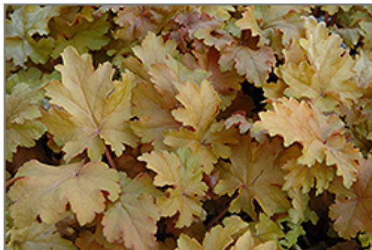
Amber Waves Coral Bells foliage

Amber Waves Coral Bells will grow to be only 6 inches tall at maturity extending to 12 inches tall with the flowers, with a spread of 12 inches. When grown in masses or used as a bedding plant, individual plants should be spaced approximately 10 inches apart. Its foliage tends to remain low and dense right to the ground. It grows at a medium rate, and under ideal conditions can be expected to live for approximately 10 years. As an evergreen perennial, this plant will typically keep its form and foliage year-round.