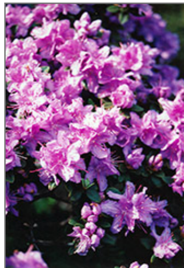
Ramapo Rhododendron flowers

Ramapo Rhododendron will grow to be about 3 feet tall at maturity, with a spread of 3 feet. It has a low canopy. It grows at a slow rate, and under ideal conditions can be expected to live for 40 years or more.