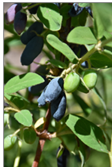
Cinderella Honeyberry fruit

This is a dense multi-stemmed deciduous shrub with a more or less rounded form. Its average texture blends into the landscape, but can be balanced by one or two finer or coarser trees or shrubs for an effective composition. This plant will require occasional maintenance and upkeep, and is best pruned in late winter once the threat of extreme cold has passed. It is a good choice for attracting butterflies to your yard. It has no significant negative characteristics.