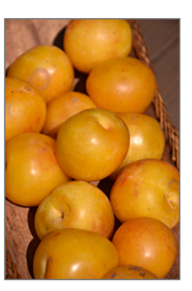
Brookgold Plum fruit